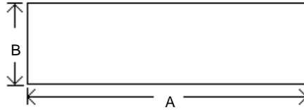
Top View Without Mullions

Can be built With or Without Center Mullion (Dependant on Size)